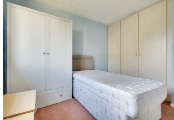
Bedroom 9'7 x 9'6 (2.92m x 2.90m) Shower room